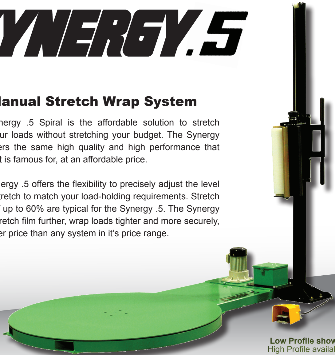
Low Profile shown High Profile available

The Synergy .5 offers the flexibility to precisely adjust the level of film stretch to match your load-holding requirements. Stretch levels of up to 60% are typical for the Synergy .5. The Synergy .5 will stretch film further, wrap loads tighter and more securely, at a lower price than any system in it's price range.